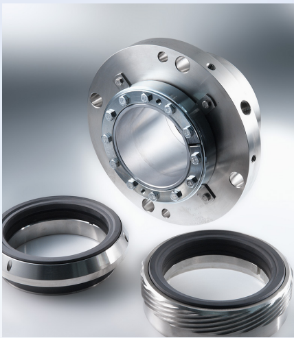
Durable and proven: EagleBurgmann mechanical seal type DFSAF